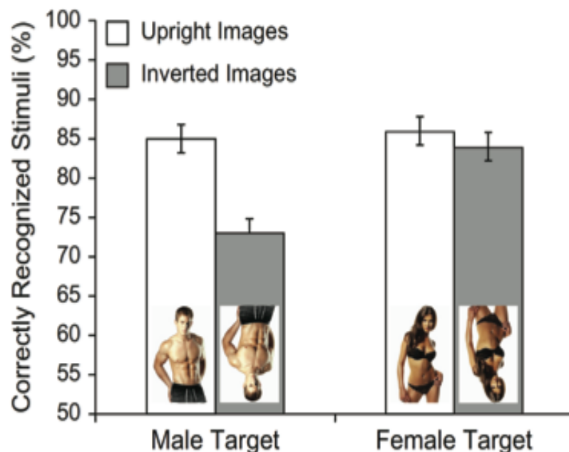
Figure 1. Percentage of correctly recognized stimuli as a function of target gender and target orientation. Error bars indicate \pm 1 SEM.

Are women human? – not when they are sex objects.